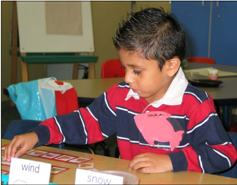
Children learn new words, names of things, the letters in his/her name, and all about going to school.