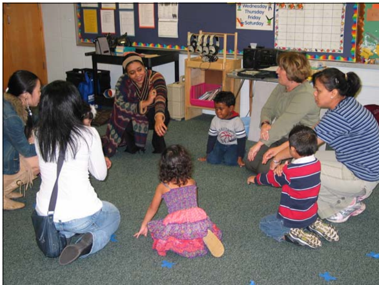
Adults and children practice English by listening to stories together and singing songs.