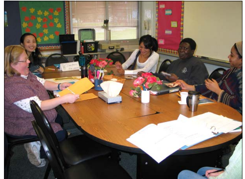
Parents learn how to teach their children and new things about District schools and the community they live in.

Classes meet at: Beaver Lake Center 1060 Sterling Street Maplewood, MN 55119